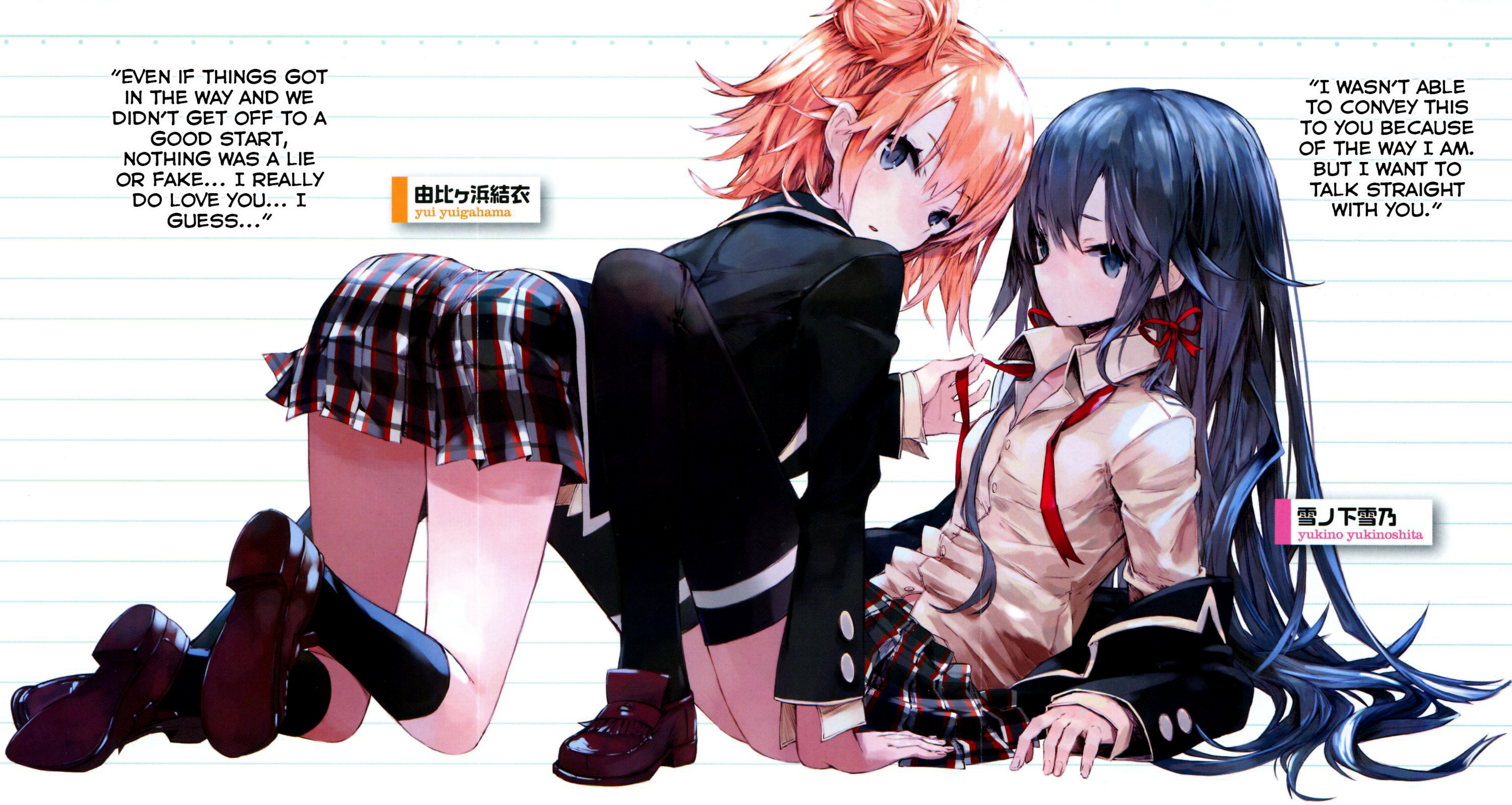
雪ノ下 雪乃 yukino yukinoshita

"I WASN'T ABLE TO CONVEY THIS TO YOU BECAUSE OF THE WAY I AM. BUT I WANT TO TALK STRAIGHT WITH YOU."